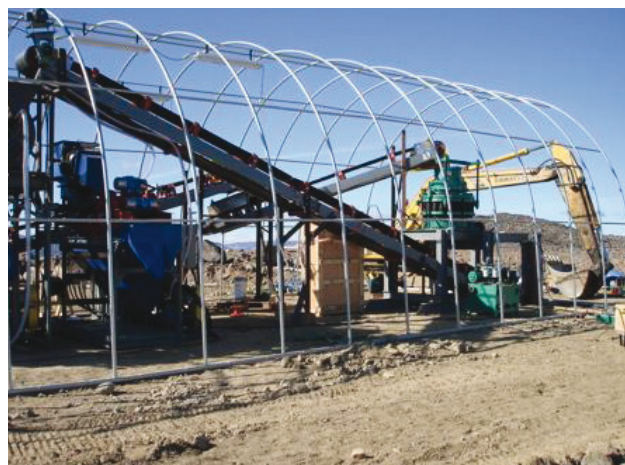
The DMS plant at Garnet lake installed (Photo:Hudson).

The Seqi olivine mine, situated 90 km from Nuuk, is based on a very large homogenous deposit of high quality olivine, with reserves at least 100 million tonnes of olivine ore. It is operated by Minelco A/S after the opening in 2005. The company supplies minerals and mineral products to the steel industry. Olivine is used extensively as a refractory raw material, as a slag conditioner in blast furnaces and as a tap hole filler in electric arc furnaces.