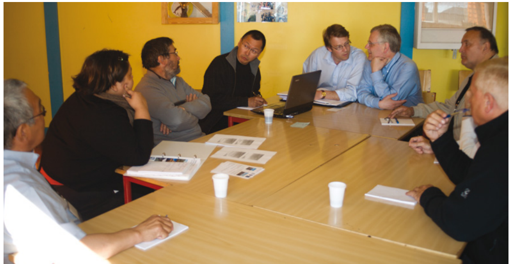
Industry, municipal and government representatives discuss various aspects of the possible reopening of the Black Angel in a subgroup at the 2007 follow-up meeting in Uummannaq.

The BMP tradition to exhibit at the yearly Roundup trade show in Vancouver, Canada, will continue in 2008. You are invited to visit the Greenland booth (C11/C12), on January 28 to January 31 2008. The exhibition and material will focus on mining and exploration, especially, gold, base metals and minerals from the magmatic environment. Stop by and meet the experts, who will be ready to tell you about geology, licensing and logistics in Greenland.