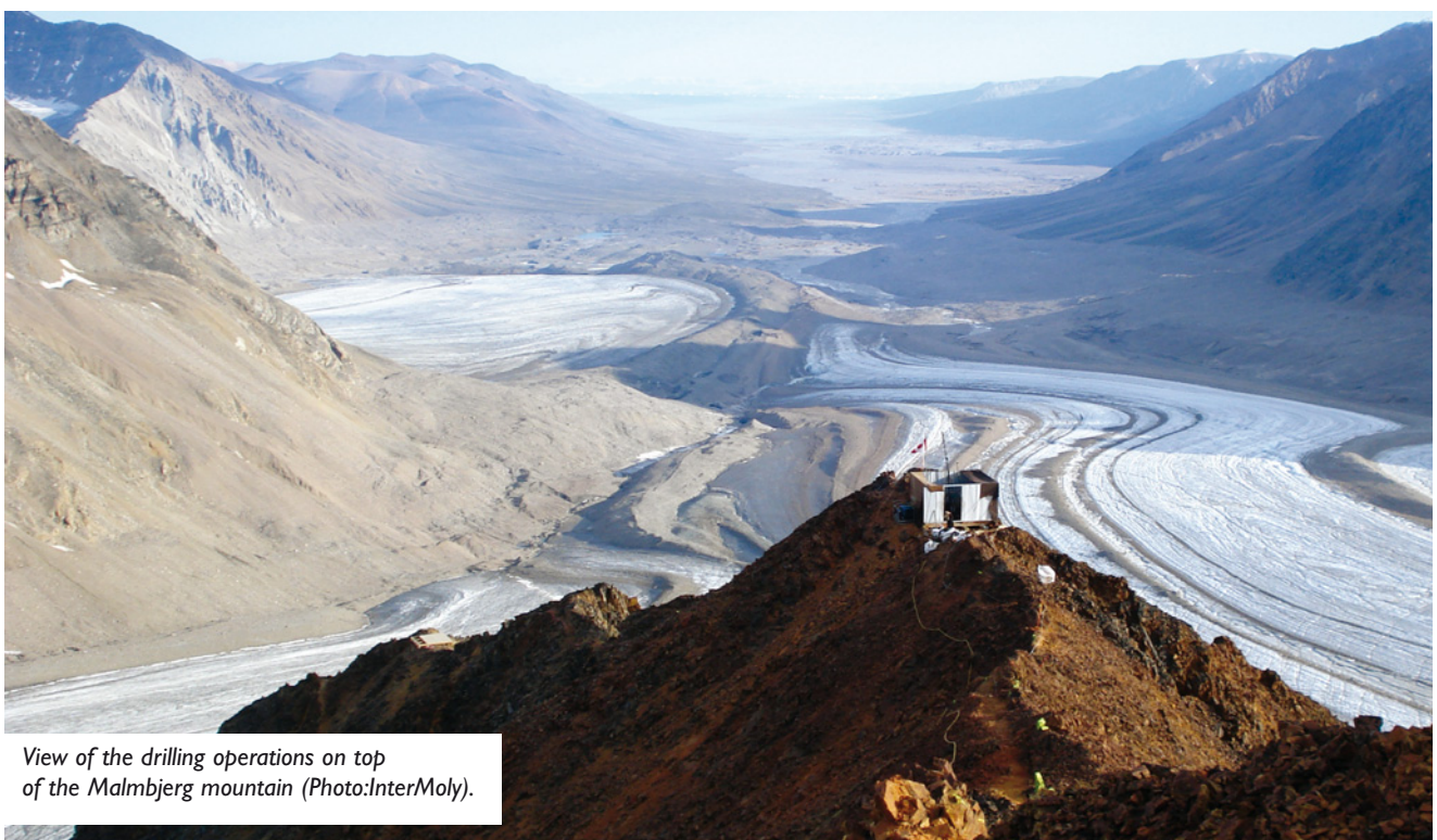
View of the drilling operations on top of the Malmbjerg mountain.

The thirty one holes completed this year, comprising 7353 metres of diamond drilling, should increase resources considerably. The Company's consultants Wardell Armstrong International are presently preparing an up to date Resource Statement for the Glacier zone as well as a Bank-