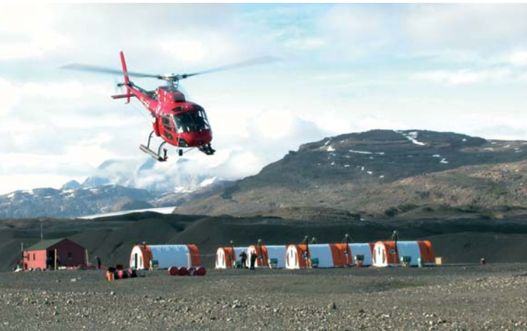
Camp operations at the Galahad Gold PLC base in Sødalen near the Skaergaard.