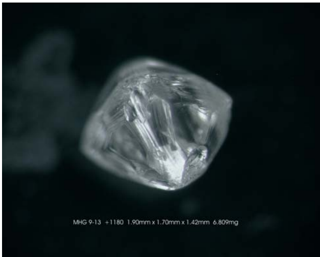
MHG 9-13 +1180 1.90mm x 1.70mm x 1.42mm 6.809mg

Largest macrodiamond recovered from the Hudson Resources exploration at 'Garnet Lake' in the Kangerlussuaq region.