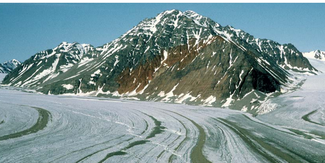
The Malmbjerg mountain squeezed between two glaciers in East Greenland)

On the west coast of Greenland, extensive areas of alteration hosting minor lenses of massive sulphide have returned anomalous nickel values. The company is seeking a joint venture partner for further exploration and development of these properties on the suspected extension of the Trans Hudson orogenic belt, host to the Canadian Thompson Nickel deposits.